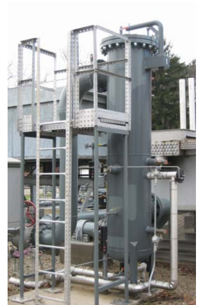
UNIT WITH INSULATED LIQUID LINES AND LADDER & PLATFORM