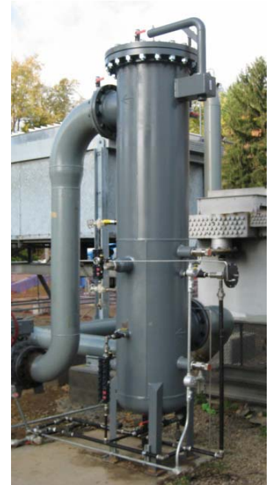
COALESCER WITH LEVEL CONTROLS